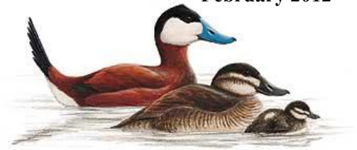
Jón Baldur Hlíðberg

B u e n a V i s t a A u d u b o n S o c i e t y