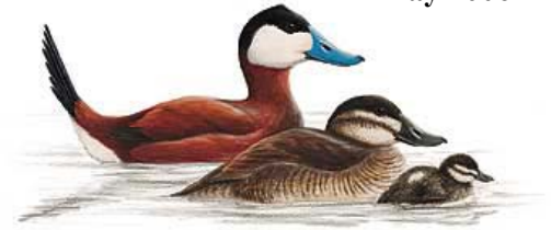
Jón Baldur Hlíöberg

B u e n a V i s t a A u d u b o n S o c i e t y