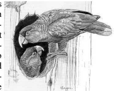
Red-crowned Parrot