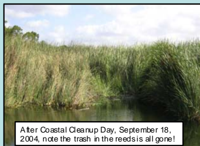
After Coastal Cleanup Day, September 18, 2004, note the trash in the reeds is all gone!

Thanks to the City of Oceanside's clean water program, Buena Vista Audubon Nature Center www.bvaudubon.org , the California Department of Fish and Game, Carlsbad Paddle Sports www.carlsbadpaddle.com , and over 50 volunteers, the waters of Buena Vista Lagoon never looked cleaner.