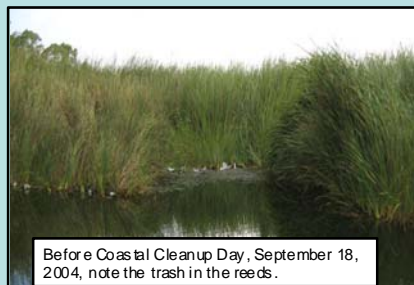
Before Coastal Cleanup Day, September 18, 2004, note the trash in the reeds.